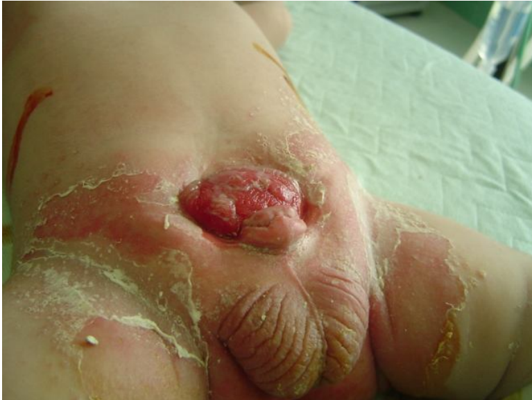
Fig. 1. A classical form of bladder exstrophy.

mention of this abnormality was seen in an Assyrian tablet from 2000 BC preserved in the British museum. It was first described by Grofenberg in 1597 [1,2] .