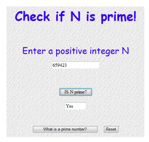
Figure 2. Checking the prime number.

In order to illustrate the section dedicated to obtain prime numbers by means of the Sieve of Eratosthenes, small function has been made. Prime number is a <u>natural number</u> that has exactly two distinct natural number <u>divisors</u>: 1 and itself. In this system will show how to check if the number is prime or not. We enter the number then we press the button. it will print if it is prime.