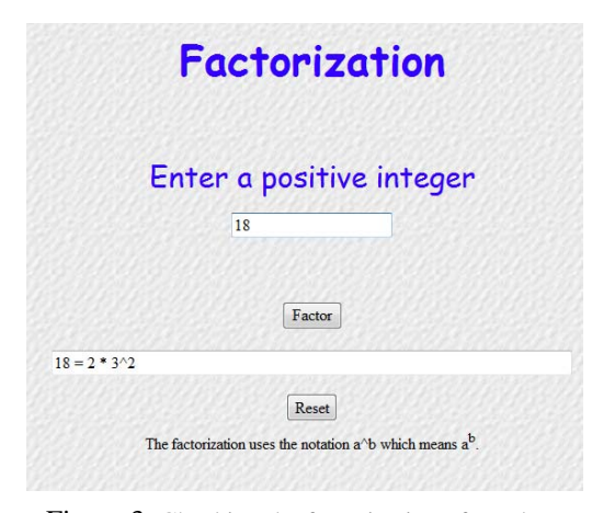
Figure 3. Checking the factorization of number.

It is the decomposition of an object (for example, a number, a polynomial, or a matrix) into a product of other objects, or factors, which when multiplied together give the original. In our system, it will show the factorization of the positive integer number. We enter the number then we press the button. It will print the factors.